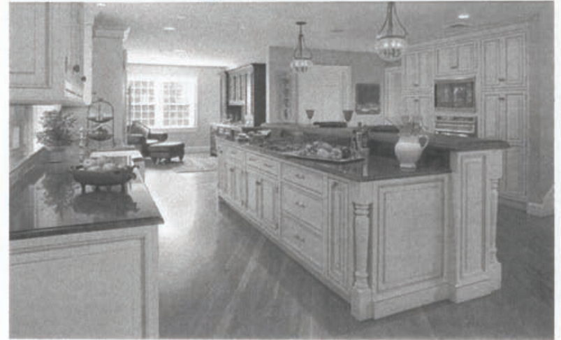
This kitchen has a two-level island. The work surface is made of Hawaiian green granite and the raised portion of the island is made of mahogany.